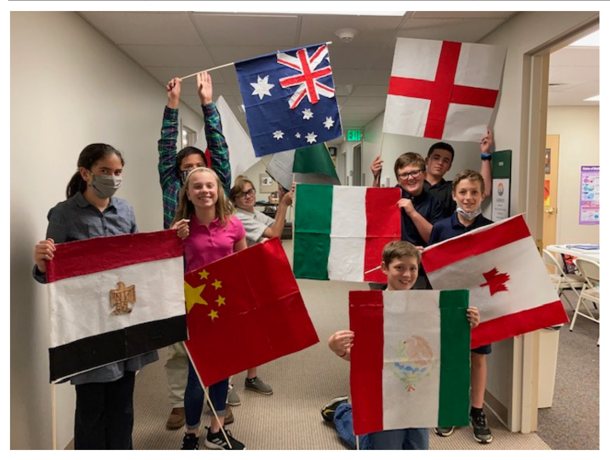
Our 7th grade students display the flags they have made in preparation for the World Fair.